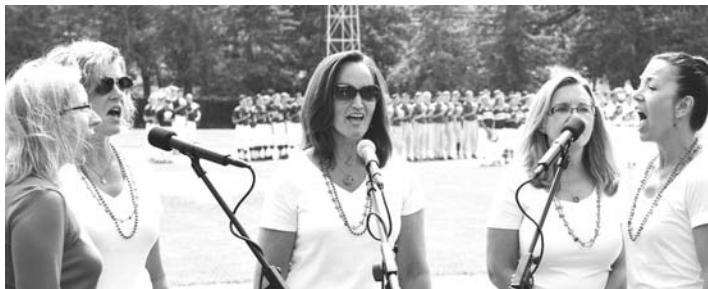
The Soul Sisters belted out the National Anthem at the opening ceremony on Thursday afternoon in Delano.

This is the first state Legion tournament held in Delano.